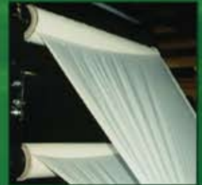
Twin Wrap Kit