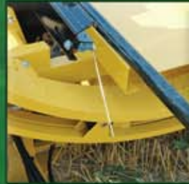
Film Shutdown Switch