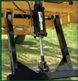
Quick-Start Power Jack

Enhance the power of X2 with the numerous useful options available. Many of these options can be added in the field with easy set-up instructions.