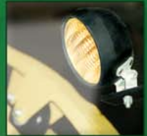
Night Working Light Kit