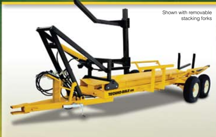
Shown with removable stacking forks