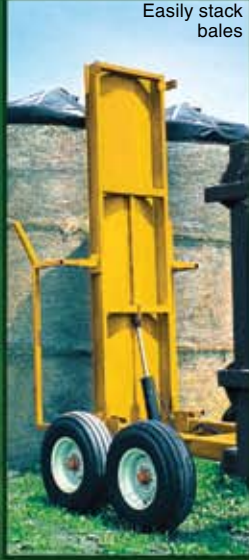
Easily stack bales