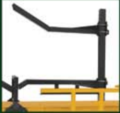
You can adjust everything from the arm to the racks on the Tube-Line Techno-Bale

Tube-Line introduces one of the safest, fastest and easiest ways to move round bales from the field. All that, and less compaction too.