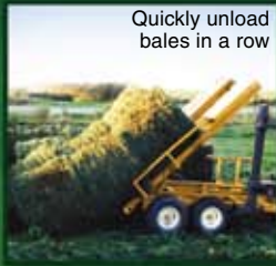
Quickly unload bales in a row

The Techno-Bale's fully adjustable arm is designed to give the bale a spin before picking it up, so you can follow the path of the baler without time-consuming and damaging cross-tracking. You can adjust everything from the arm to the racks on the Techno-Bale to fit your preferred bale size, from 4x4 to 6x5, for safe and simple operation. The convenient hydraulics are designed to work with most tractors' available hydraulics, moving from the loading cycle to the unloading cycle with the flip of a switch.