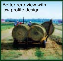
Better rear view with low profile design